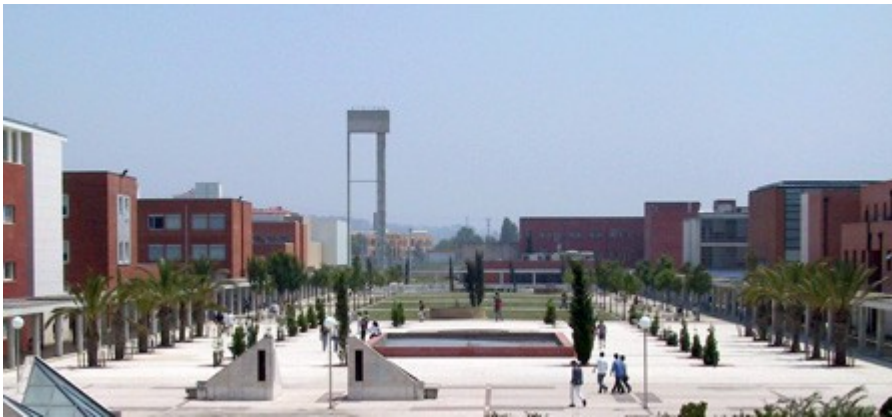
University of Aveiro – campus – a small city inside the city

For the very first time the Alliance is organizing, in cooperation with other partners, its first Summer School, to be held from 15 to 21 August in Portugal, at the University of Aveiro.